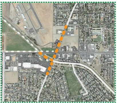
Option 2: Canal/West I St

A route from Merced College to Downtown, utilizing the upcoming shared use path from the College and roadways north of Pacheco.