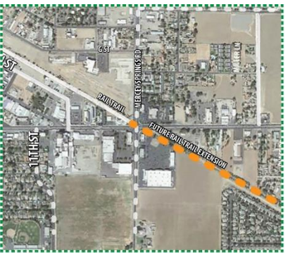
Option 3: Rail Trail

On-street bicycle lanes along SR-152/Pacheco Boulevard in the roadway, which could require reconfiguration of the roadway and shoulders to accommodate bicycles.