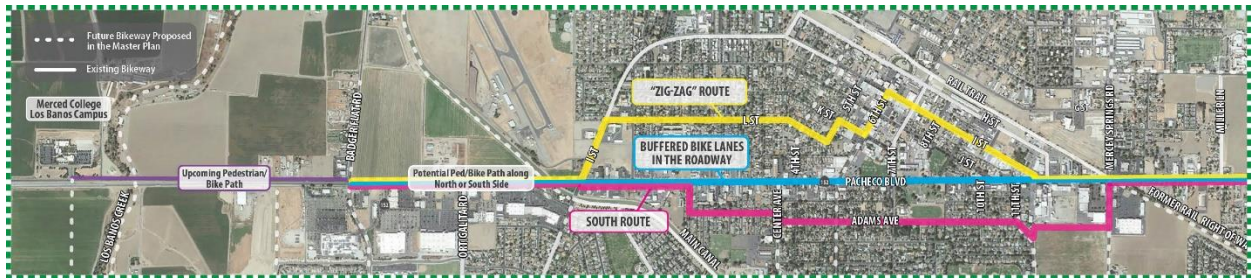
Option 1: “Zig-Zag” Route

In terms of potential east-west bike routes along or parallel to Pacheco Blvd., workshop participants and survey respondents preferred Option 1: the ‘Zig-Zag’ route, followed by Option 3: the ‘South Parallel’ Route. Adding a bike lane to Pacheco Boulevard itself was the least popular option among both online survey respondents and workshop participants.