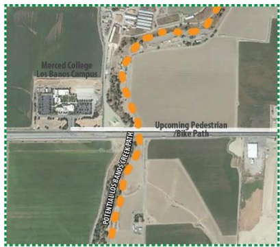
Option 1: Los Banos Creek Trail

Finally, for potential north-south bike routes that would cross Pacheco Blvd., both workshop participants and online survey respondents preferred Option 1: Los Banos Creek Trail as the number one priority. Results varied between workshop participants and online survey respondents in terms of ranking the other two north-south bike route options: workshop participants preferred Option 3: the Rail Trail as a second priority and Option 2: the Canal/West I Street route as the third priority, while online survey respondents preferred Option 2 as the second priority and Option 3 as the third priority.